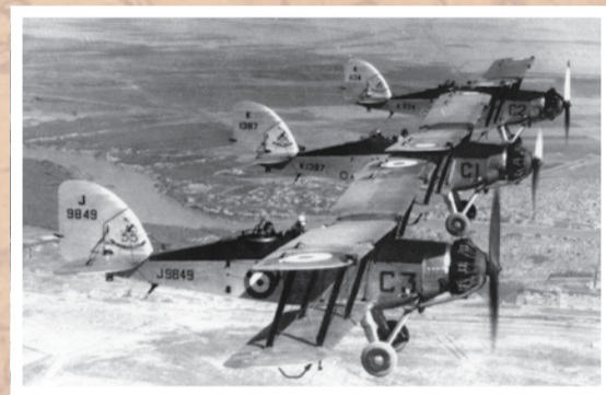
► Westland Wallace's on active service

☛ In 1933, The Westland Aircraft Works, still a branch of Petters Ltd, was employing nearly 3,000 people and manufacturing two successful Westland designed military aircraft ☛