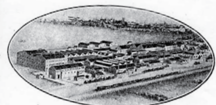
The Works of Petters Ltd. Photographed from a Westland Aeroplane.

THE WORKS OF PETTERS Ltd., YEOVIL Manufacturers of Engines and Aircraft.